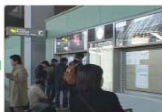
⑤ Ticket machines