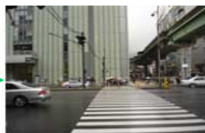
②Turn left after the crossing