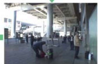
④ Limousine bus stops