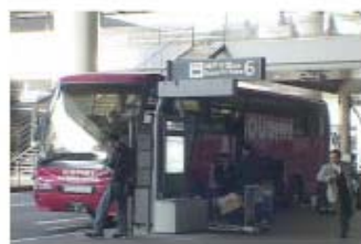
⑥ Bus stop (No. 6)