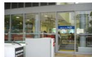
④Waiting room on the right