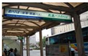
①Bus arrival from the airport