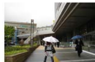
③To the bus stop